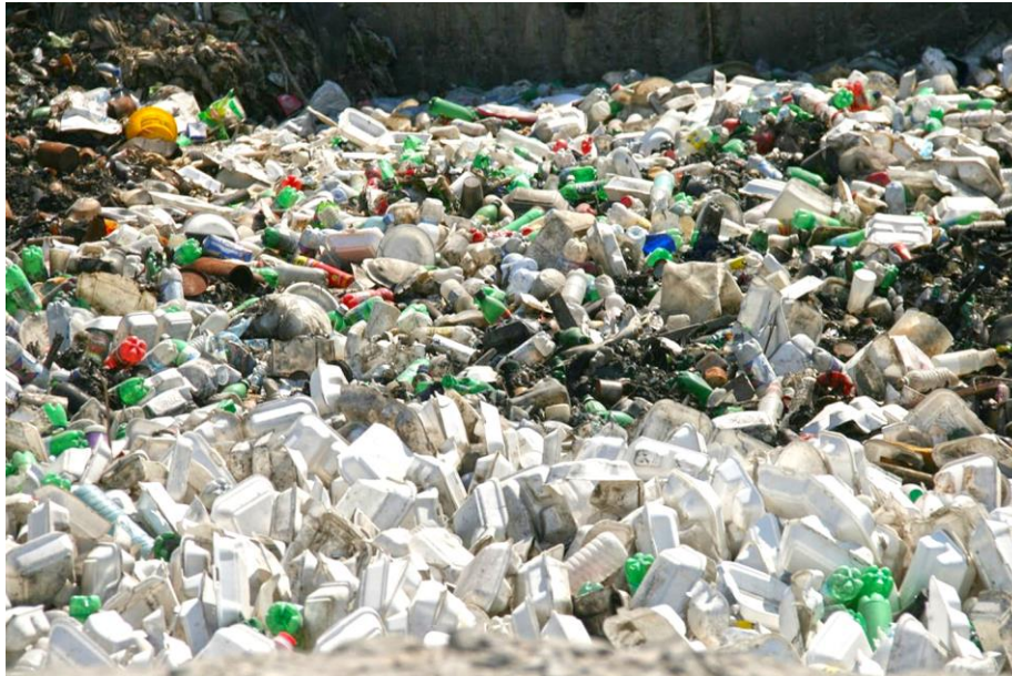
SINGLE-USE plastics take thousands of years to decompose.

Environmental organizations called on the Cebu City government to ban single-use plastics and polystyrene foam after flash floods affected the city recently.