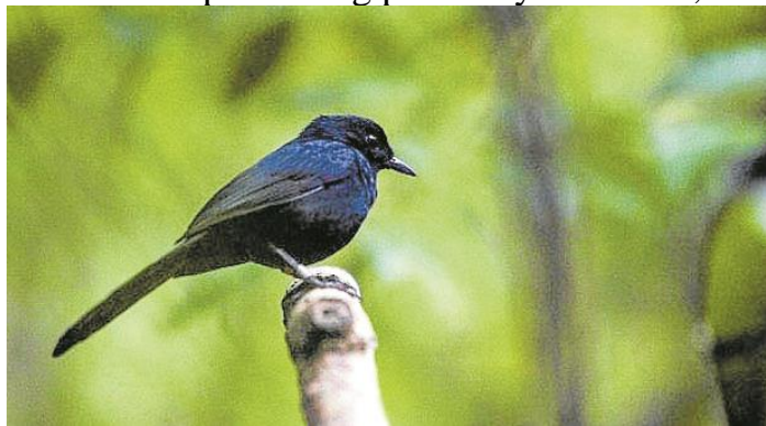
ENDANGERED The forest in Barangay Nug-as in Alcoy, Cebu, is home to the endangered black shama ( Copsychus cebuensis ), known locally as “siloy.”

PMSC-Alcoy Plant holds a mineral processing permit by the MGB, which will expire in 2023.