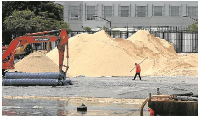
MANILA BAY ATTRACTION Mounds of crushed dolomite from Cebu await to be leveled along a section of Manila Bay for the government’s beach nourishment project in this photo taken in September. The area covered by “white sand” was an instant attraction during its opening, but portions of the beach had since been washed out.

But its number continued to decline due to rampant forest clearing by slash-and-burn farmers and illegal loggers.