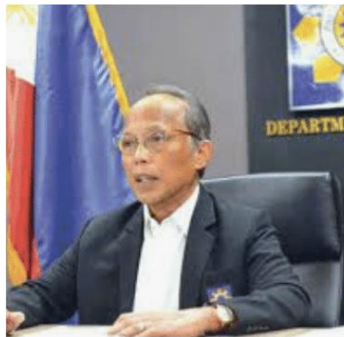
Department of Energy Secretary Alfonso Cusi (File photo)

The Department of Energy (DOE) will explore the potential of mangrove sequestration in managing carbon dioxide (CO2) emissions in a bid to curb future impacts of climate change.