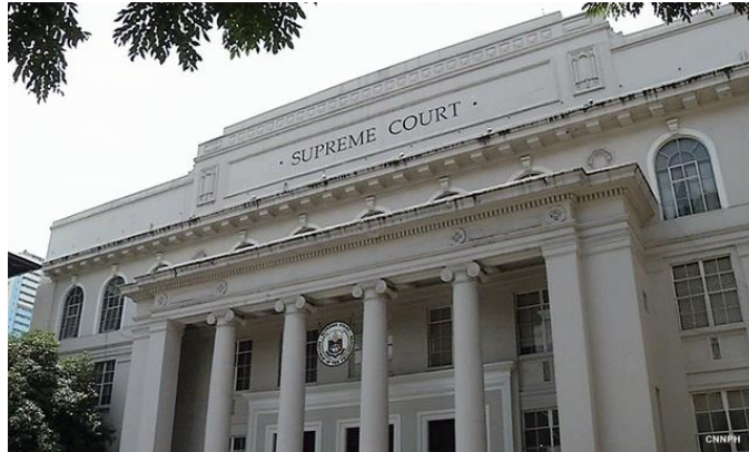
Photo of Supreme Court facade

THE Supreme Court has unanimously junked the petition filed by environmental organizations and several residents who petitioned for the issuance of a writ of kalikasan and a writ of continuing mandamus to enjoin the establishment of a diesel power plant by a power generation company in Mambajao, Camiguin.