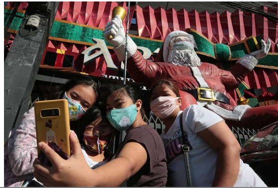
Shoppers take a selfie with a Santa Claus decoration on November 30, 2020.