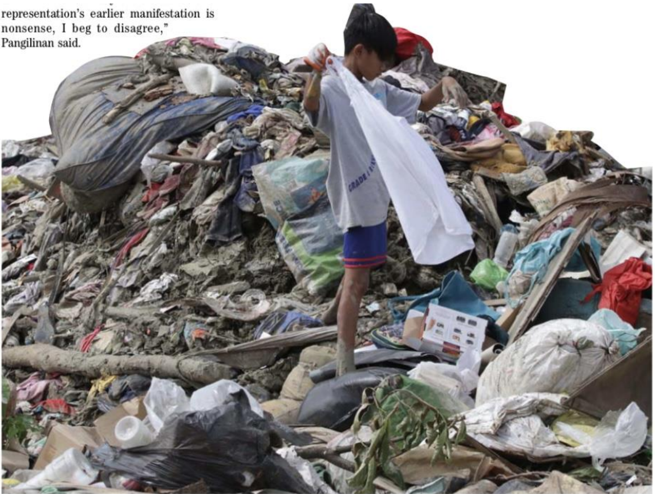
DUMP gives this boy a lifeline as he collects recyclable materials to sell.