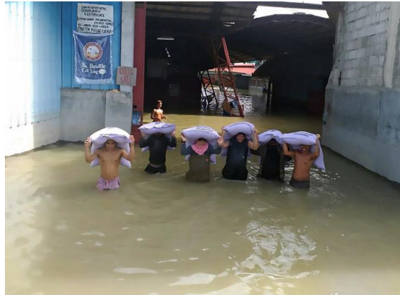
Poultry farm workers unload chicken feed for egg-laying chicken at a poultry farm in Barangay Bulusan in Calumpit, Bulacan, one of the areas heavily hit by flooding due to Typhoon Ulysses.

The Climate Change Commission (CCC) on Tuesday lauded the move to adopt the climate body's resolution to declare a climate and environmental emergency in support of the effort to address the worsening impacts of climate change.