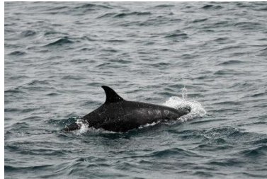
Photo of dolphins sight BFAR-12, DENR-12, and personnel of Sarangani Governor’s office at Sarangani Bay in Sarangani province.

ZAMBOANGA CITY – Several Risso and spinner dolphins have been frequently seen at the Sarangani Bay, near Malapatan and Alabel in Sarangani Province, which could be an indication that the bay has remained safe for such mammals to thrive.