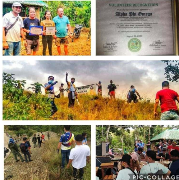
APO tree planting sa Daang Kalikasan

By Bombo Radyo Dagupan -August 30, 2020 | 4:31 PM