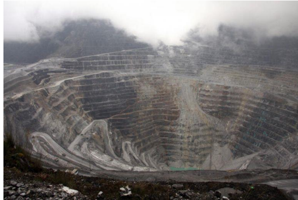
The Grasberg mine is expected to produce 110,000 tonnes of copper ore per day in 2020.

TIMIKA, Indonesia (AFP) — Operations have resumed at the world's biggest gold mine in Indonesia, the company that runs it said Saturday, after workers blocked access to the site in protest at being stopped from visiting their families over virus concerns.