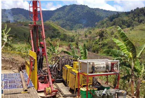
Site of the Sagittarius Mines, Inc's Tampakan mining operation in Mindanao, Philippines.

The US$5.9 billion project has faced opposition since mineral reserves were discovered there in the '90s, with pushback coming from indigenous communities, the Catholic church, environmentalists, and even communist rebels.