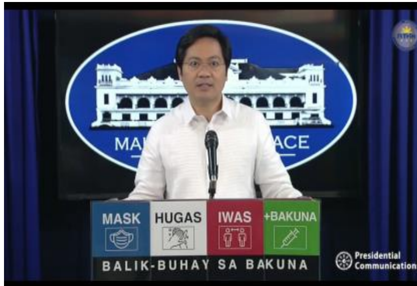
Cabinet Secretary Karlo Nograles

By Filane Mikee Cervantes December 31, 2021, 9:16 pm