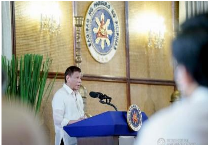
President Rodrigo Duterte

MANILA – President Rodrigo Duterte on Friday reminded Filipinos to cherish all their experiences gained from the year about to end, including struggles and victories in overcoming the Covid-19 pandemic and the damage caused by Typhoon Odette in Visayas and Mindanao.