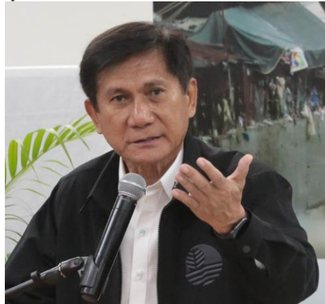
Environment Secretary Roy Cimatu

Philippine Daily Inquirer / 05:32 AM February 19, 2022