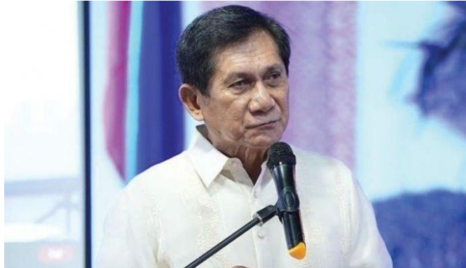
Undated photo from the Department of Environment and Natural Resources shows Secretary Roy Cimatú.

By Malou Escudero (Pilipino Star Ngayon) - February 19, 2022 - 12:00am