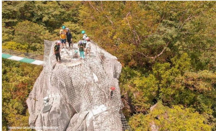
Masungi Georeserve (FILE PHOTO)

Metro Manila (CNN Philippines, February 19) — Conservation group Masungi Georeserve on Saturday said seven of its rangers were attacked by a mob, with two ending up hospitalized.