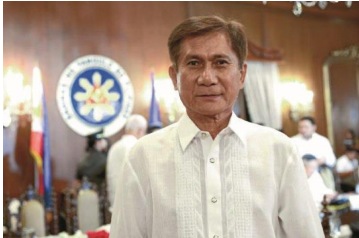
Resigned Environment Secretary Roy Cimatu.

A member of Philippine Military Academy Class of 1970, Cimatu served in the military for 37 years until his retirement as the 30th chief of the Armed Forces of the Philippines in 2002. He was appointed to DENR in 2017, replacing the late Gina Lopez.