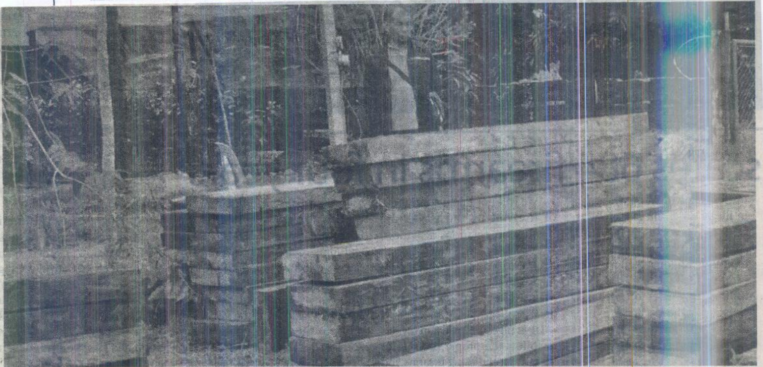
■ More than 4,000 board feet of lumber worth P2 million are seized from a suspected illegal-lumber transporter in a town in Nueva Vizcaya on January 21, 2023. CONTRIBUTED PHOTO