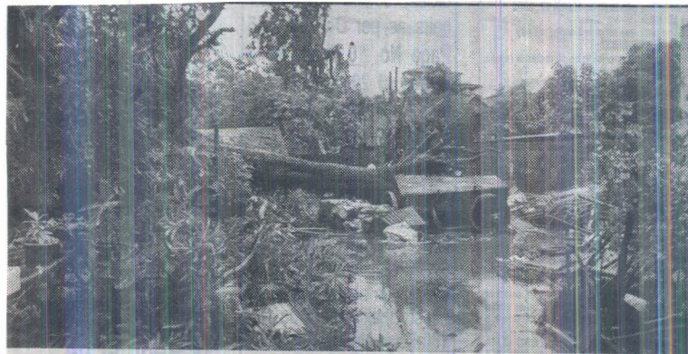
Nagtumbahan ang mga puno at nasa 50 kabahayan ang winasak habang dalawa katao ang sugatan nang tumama ang malakas na buhawi sa dalawang lugar sa Arevalo, Iloilo City kahapon ng umaga.