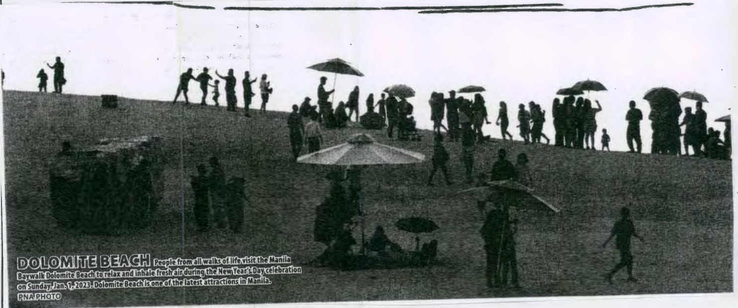
DOLOMITE BEACH People from all walks of life visit the Manila Baywalk Dolomite Beach to relax and inhale fresh air during the New Year's Day celebration on Sunday, Jan. 1, 2023. Dolomite Beach is one of the latest attractions in Manila.