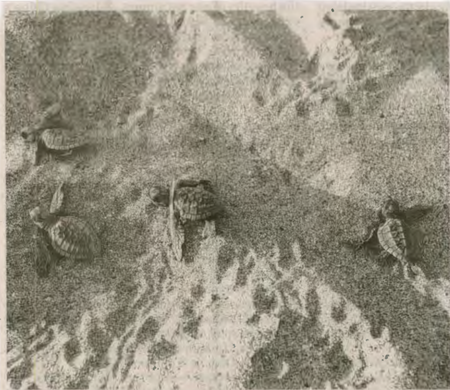
FIRST HATCH OF 2023: On the first sunrise of 2023, hatchling turtles Olive Ridley species crawl their way to the sea waters in front of ACEA Beach Resort in Subic Freeport Zone, Zambales. The sighting of baby turtles is a regular occurrence every Jan. 1 in the resort.