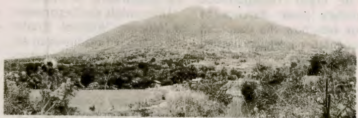
PROTECTED MOUNTAIN Mt. Arayat in Pampanga is now a protected area.

"The legislation of new PAs also contributes to the achievement of the Aichi Target 11 of the Convention on Biological Diversity, which calls for improvement and increase in the number of PAs among the parties including the Phil-