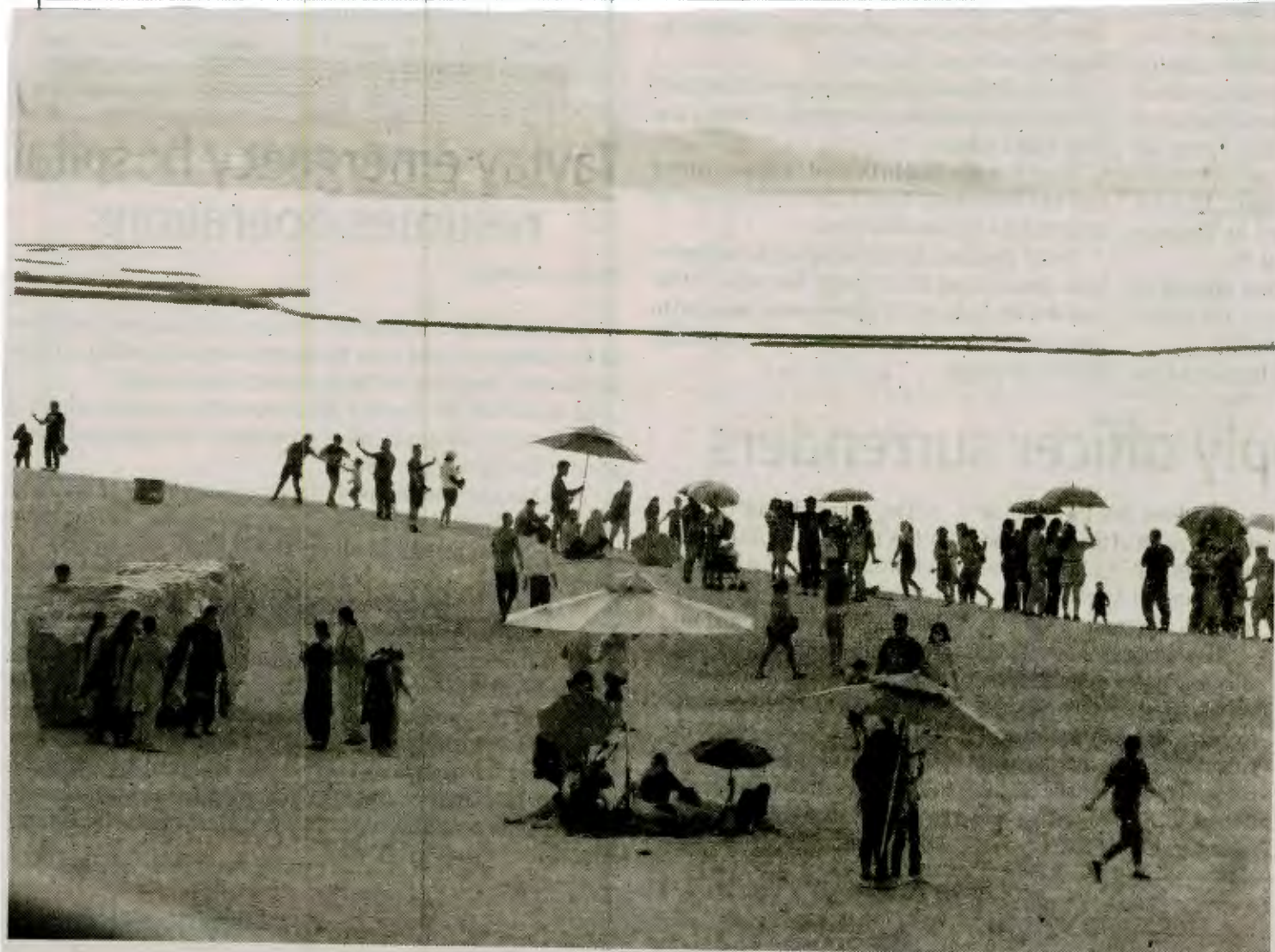
AMID the controversies surrounding the Manila Baywalk Dolomite Beach along Roxas Boulevard, people still choose to spend the first day of the New Year at the location along with their families.