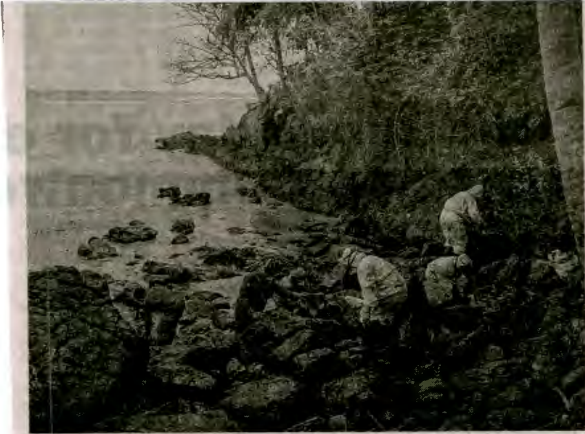
GROUND ZERO. Volunteers dressed in personal protective equipment clean up the oil spill on the shore of Pola in Oriental Mindoro caused by the sunken fuel tanker MT Princess Empress. Pola town is among the municipalities hardest hit by the oil spill. It has been under a state of calamity since Friday.