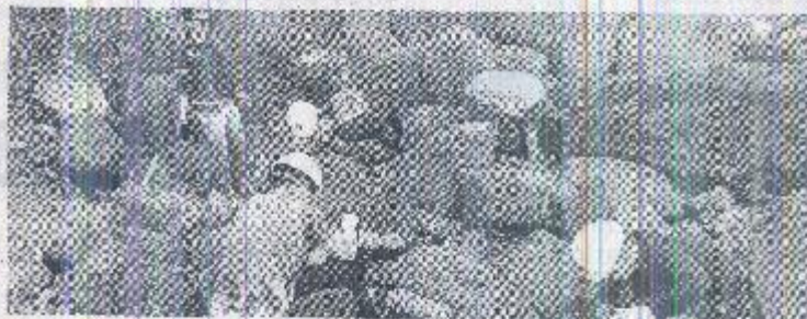
CLEANUP Volunteers from DMCI Power Corp. pick out, scrape and shovel industrial oil stuck to rocks in the shores of Barangay Misong in Pola, Oriental Mindoro, on March 3.

"It has been one week since the oil spill. The affected area used to be our rich fishing grounds. Our small savings are running out. Most children here are schooling and we have to spend for transportation, 'baon' (pocket money) every day and other needs of our