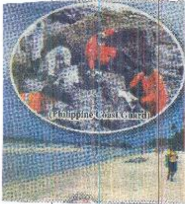
(Philippine Coast Guard)