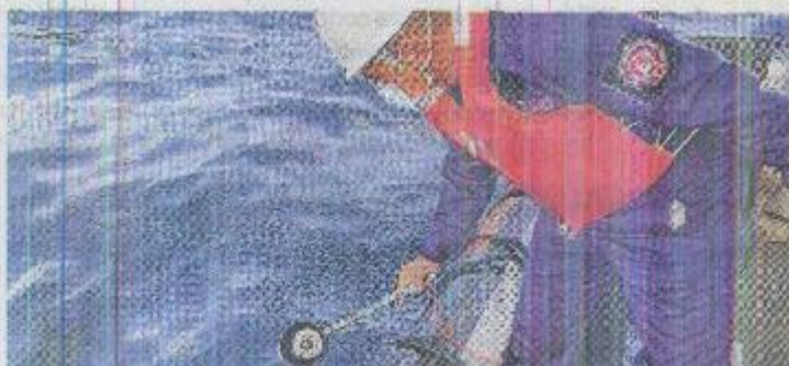
WATER SAMPLING In this handout photo from the Philippine Coast Guard and taken on March 2, a coast guard personnel collects water samples from an area hit by oil spill off the waters of Naujan, Oriental Mindoro. The spill, a mix of industrial fuel and oil, came from a tanker that sank there on Tuesday.

After conducting water sampling in Naujan, Pola and Pinamalayan towns, the Environmental Management Bureau reported that 21 marine protected areas, located as far as 40 km from the eastern sec-