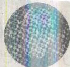
SENIOR BYAHERO JOSEPH BAUTISTA

It must have been the water from the fountain of youth that brought back the energy to continue the exploration of the succeeding chambers. Gone was the fear that I will not be able to keep up with the younger members. In fact, I started walking past them as I went ahead and crossed the chest-deep water to the "cathedral" chamber where a skylight coming from an opening at the top illuminates an altar-shaped crystal formation.