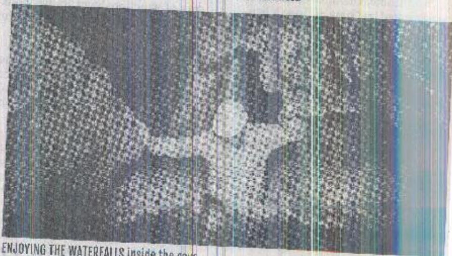
ENJOYING THE WATERFALLS inside the cave.

of the young influencers in the group made themselves busy taking selfies. I asked the guide how long the cave is, and he replied "kilometers long," then added that we are doing only the "basic" which we can cover in about two hours.