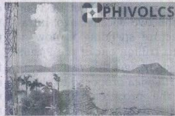
‘DEGASSING’ Footage taken from Taal Volcano Observatory catches the degassing activity from the main crater on June 4.