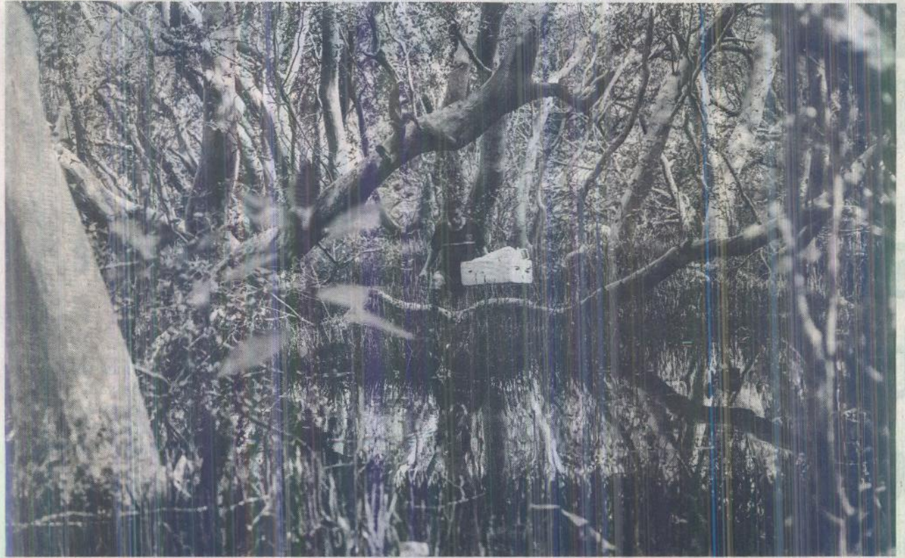
ON THE WATCH — A man is dwarfed by the thick mangrove at the Las Piñas-Parañaque Wetland Park where he had ventured to go fishing. The preservation of such mangroves is one of the focal points during the observation of World Environment Day on June 5, 2023. (Ali Vicoy)