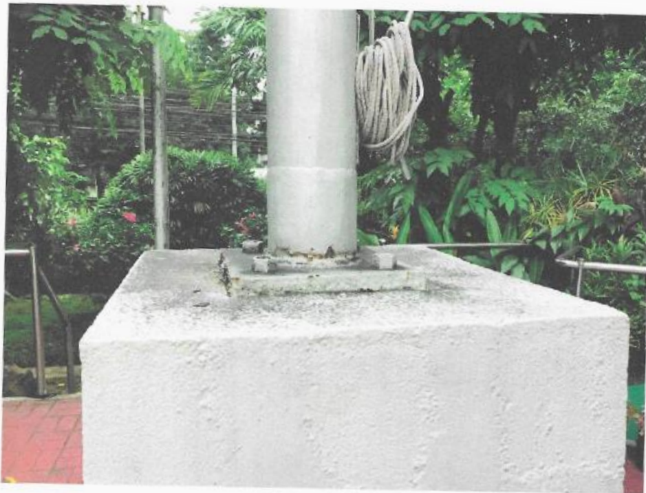
PIC 3: EXISTCONNECTION BETWEEN THE POLE AND THE PEDESTAL