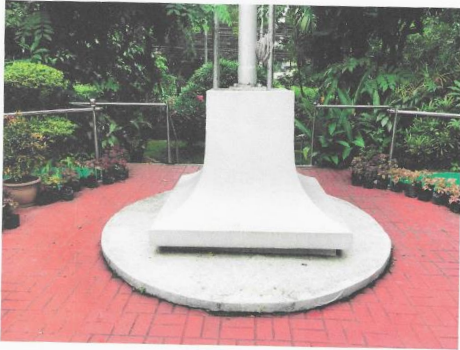
PIC 2: EXISTING PEDESTAL OF THE MIDDLE POLE