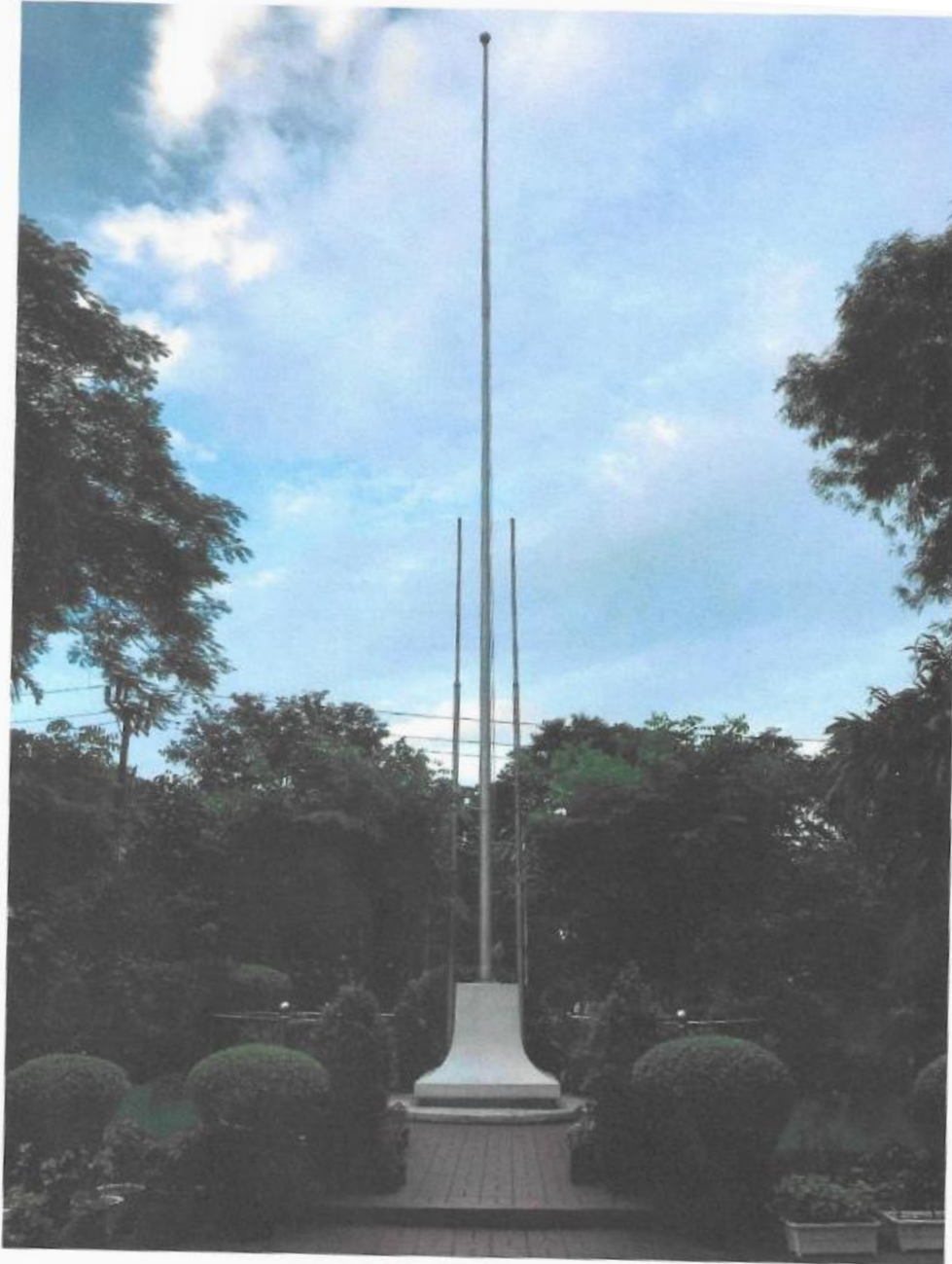
PIC 1: PHOTOGRAPH TAKEN IN FRONT OF THE POLES