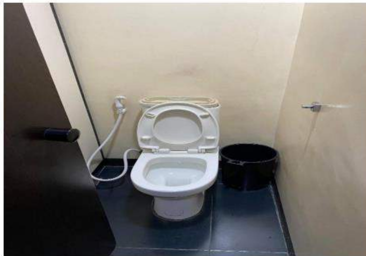
Clogged water closet and damaged flush Button