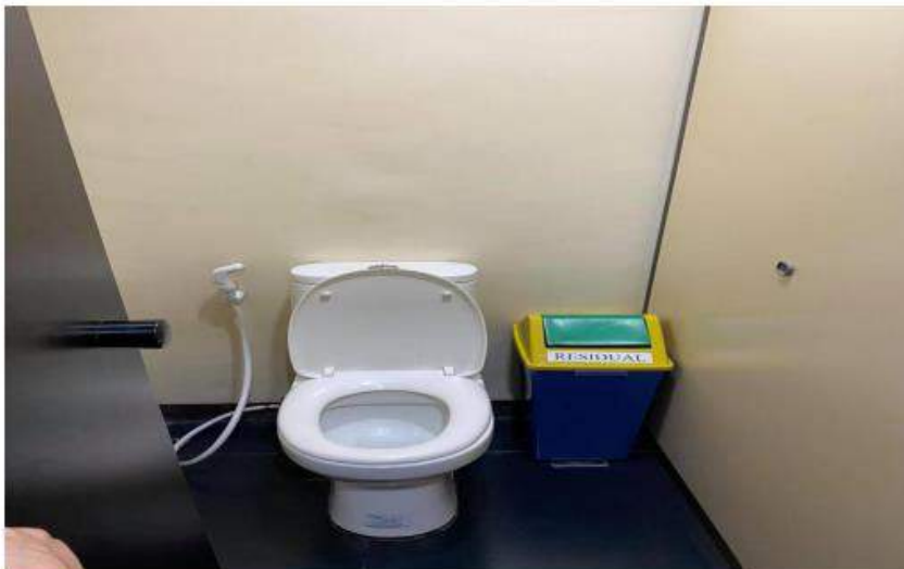
Broken tissue holder