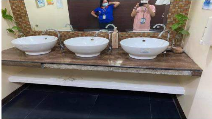
Broken Counter tiles