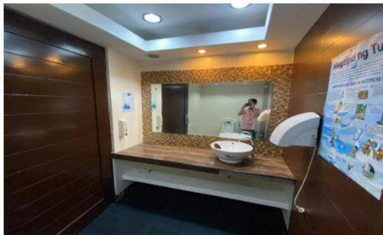
Detached Counter Tiles