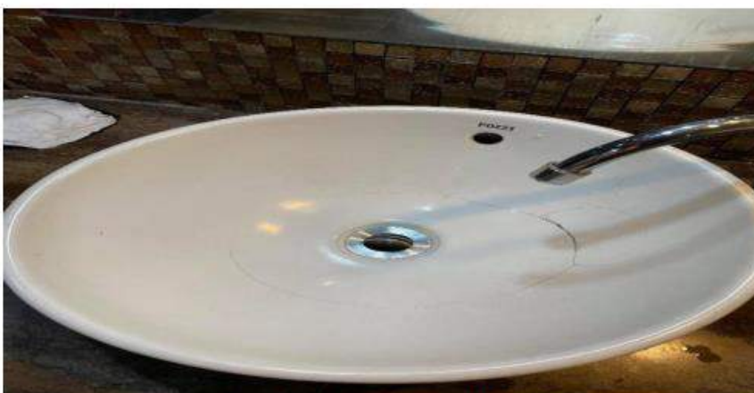
Cracked Lavatory and P-trap