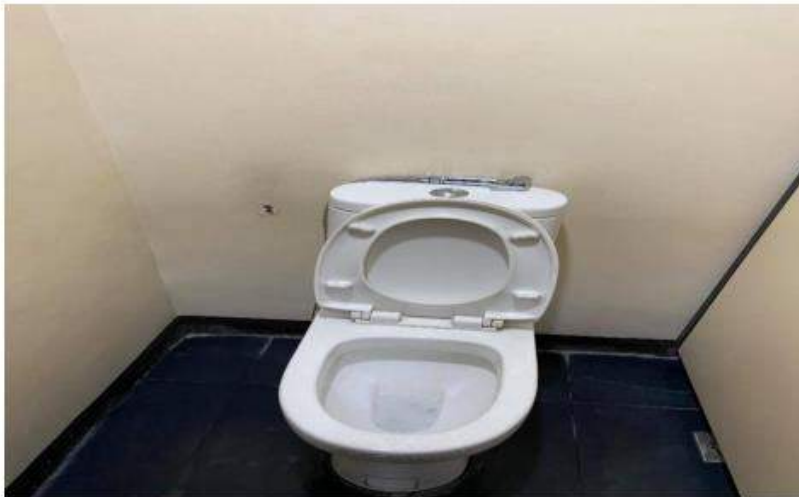
Broken handle of bidet