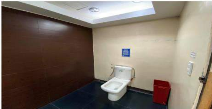
Broken handle bidet