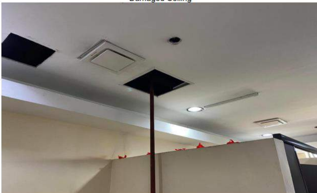
Restoration of Ceiling