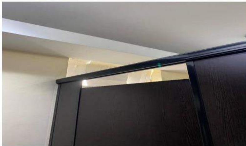
Broken Cubicle window