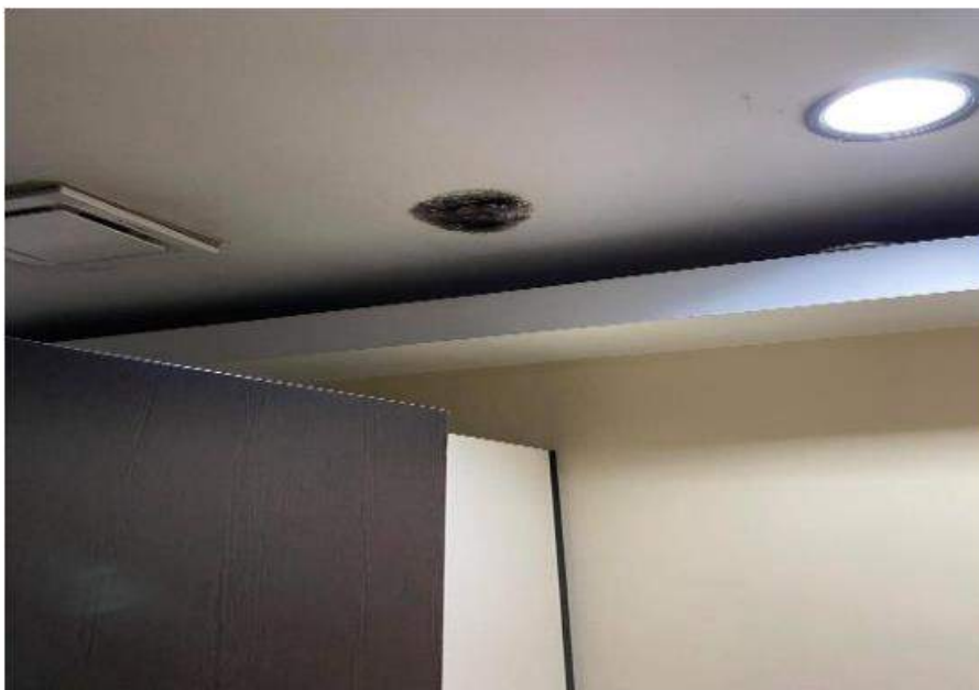
Stain on Ceiling