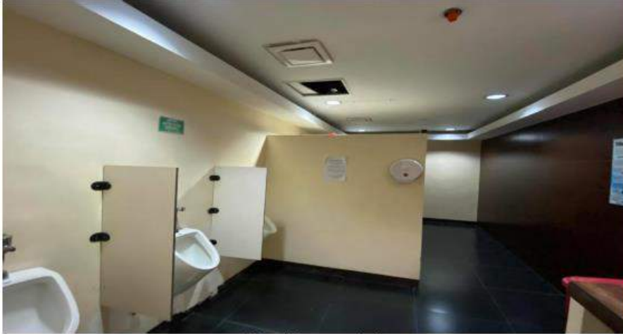
Need for repainting