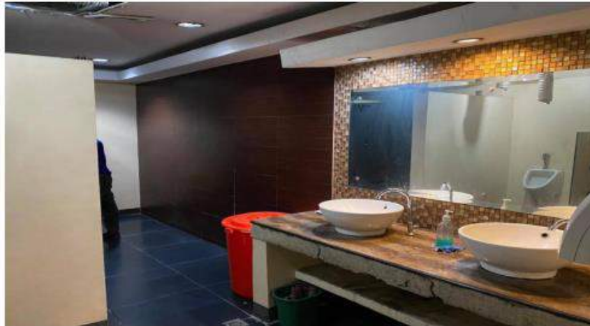
Detached Counter Tile