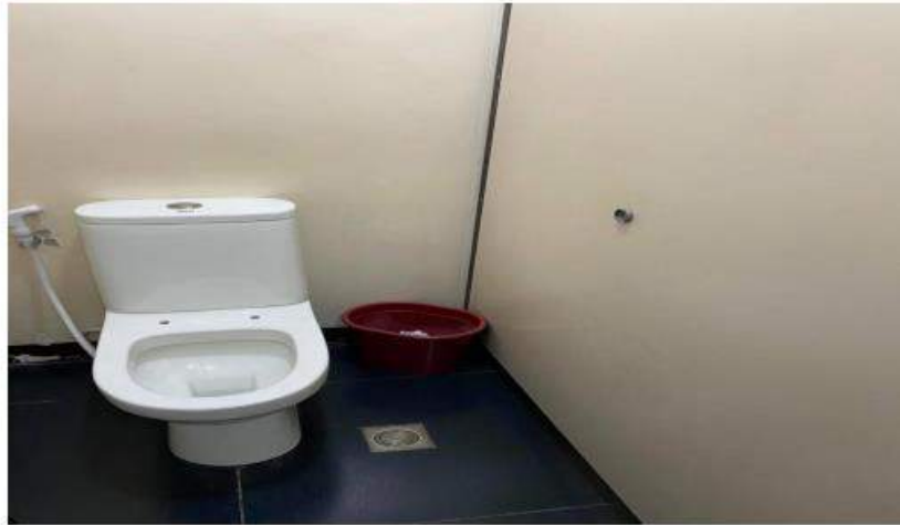
Broken tissue holder