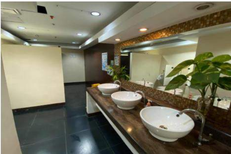
Subject for Repainting