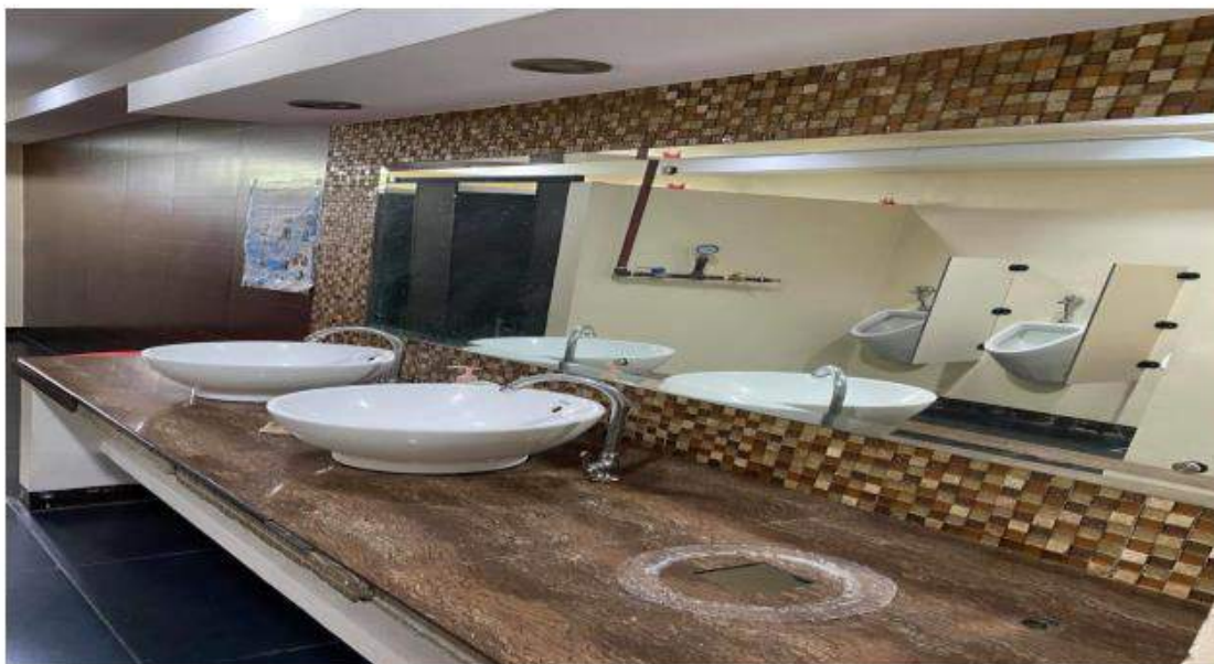
Replacement of of 1 Lavatory and Accessories, Detached Counter Tiles