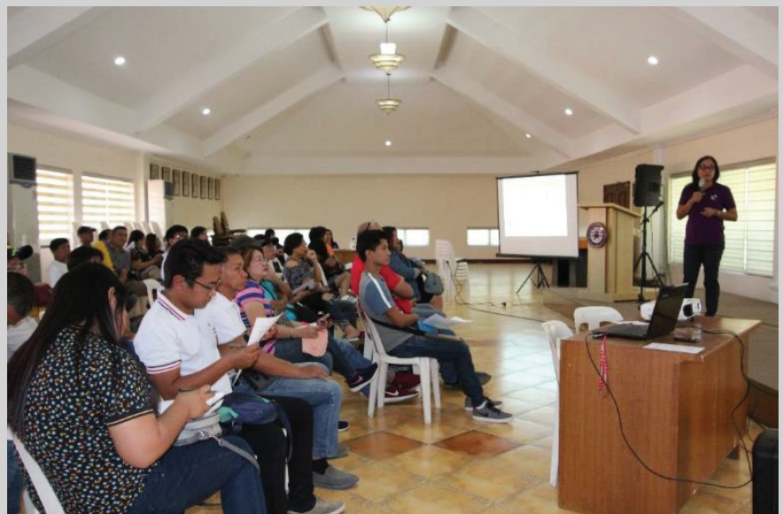
Figure 16.2 An IEC campaign entitled, "NWRB: Nangangalaga ng Water Resources ng Bansa an Education Campaign" was organized by the NWRB last 5-6 March 2020 in San Rafael, Bulacan.