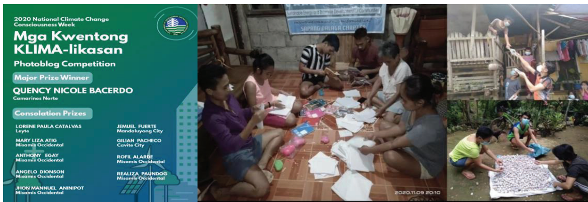
Figure 19.3 Photoblog contest