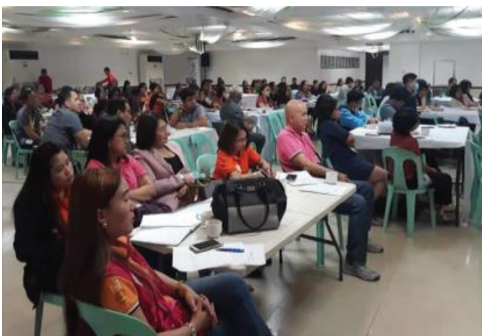
Figure 19.4 Seminar on gender-responsive approaches in climate and disaster resiliency for urban poor communities

The seminar aimed at capacitating the participants with effective gender-responsive and inclusive approaches into climate and disaster resiliency strategies especially when assisting communities, particularly women, to prepare for, respond to, and recover from any climate and disaster risks.