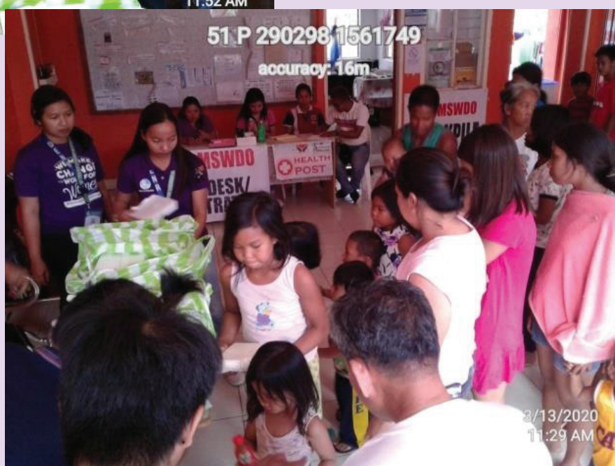
Figure 19.5 Assistance given to the communities affected by the Taal Volcano eruption