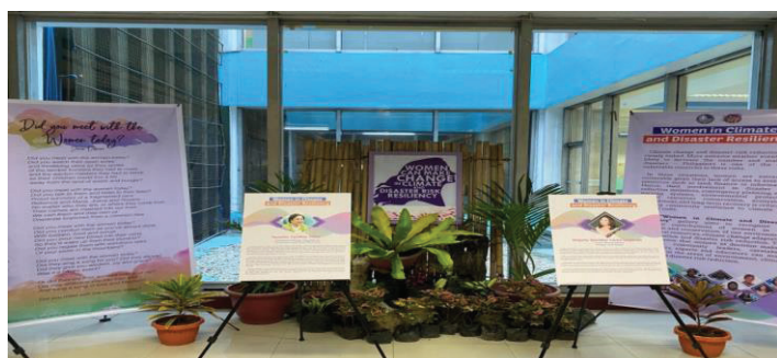
Figure 19.1 Based on the adopted local theme, "Women Can Make Change in Climate and Disaster Resiliency", 11 women leaders who displayed exemplary leadership and women empowerment in the protection of the environment and natural resources, climate change adaptation, mitigation and disaster risk reduction were featured in a photo gallery. This was displayed for public viewing and appreciation at the DENR Main Lobby, Ground floor on March 9, 2020 until March 31, 2020.