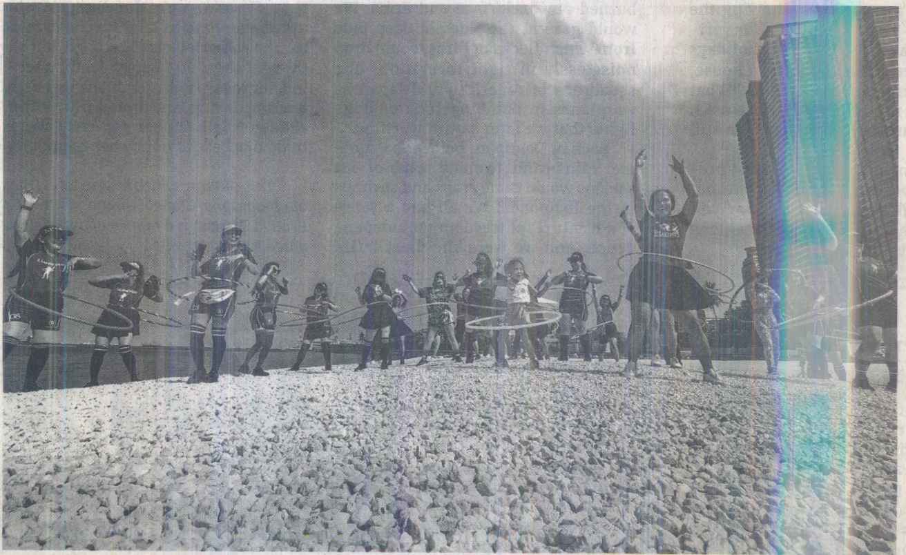
EARLY CELEBRATION – Mothers, together with their young daughters, dance using their hula-hoops at the Manila Baywalk Dolomite Beach on Roxas Boulevard in Manila, May 13, 2023, a day before Mother's Day.