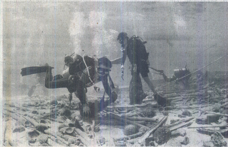
SOS Volunteers picking up waste from the reef of Anilao, Batangas

THE Philippines is now taking more steps to achieve cleaner and livelier seas as canned tuna brand Century Tuna kicked off its Saving Our Seas campaign, becoming the biggest beach clean-up in the history of Mabini, Batangas. In partnership with the impact organization HOPE, and Aling