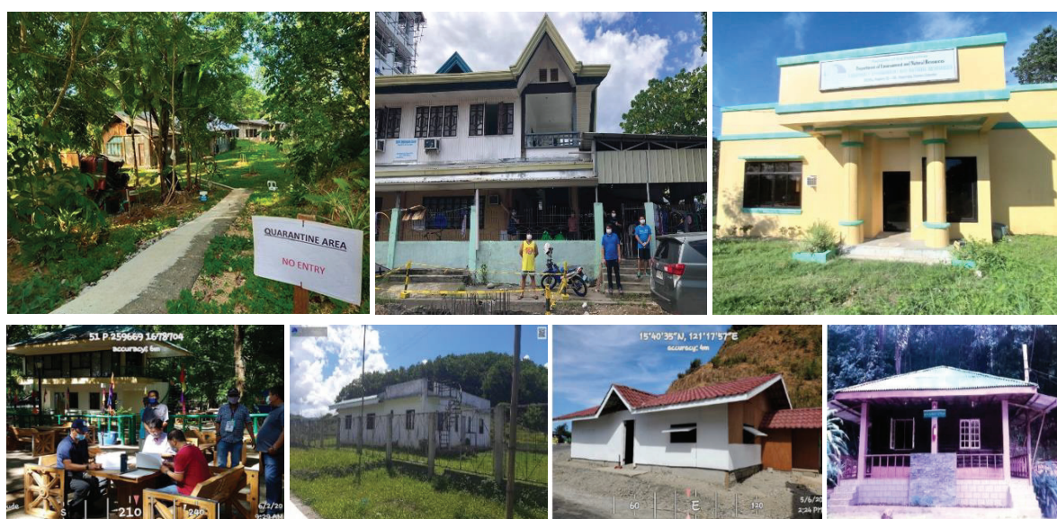
Figure 21.2 DENR facilities used as temporary quarantine facilities for PUIs/PUMs