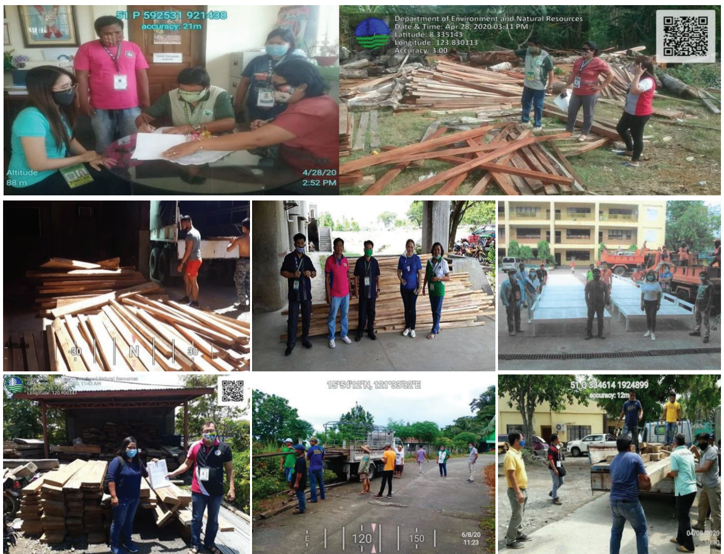
Figure 21.1 DENR field offices donated confiscated lumber for temporary quarantine facilities for PUIs/PUMs

To help in the expeditious establishment, construction and operation of temporary medical facilities, the DENR donated confiscated lumber to DPWH, LGUs, hospitals, PNP, MIATF, Provincial Engineer and Provincial Health Office, among others, intending to put up/refurbish COVID-19 quarantine/isolation facilities.