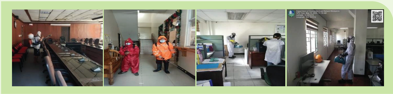
Figure 21.8 Aside from strict enforcement of health protocols, regular disinfections of DENR offices and premises is being undertaken using fogging machines with solution for disinfection to ensure COVID-free working unit.