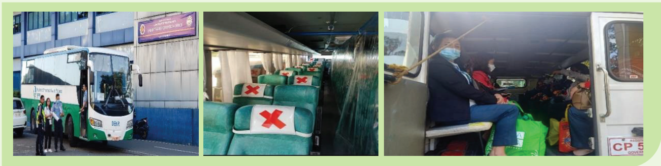
Figure 21.9 Office vehicles were also assigned/used to ferry employees from their respective residences to the office and vice versa.