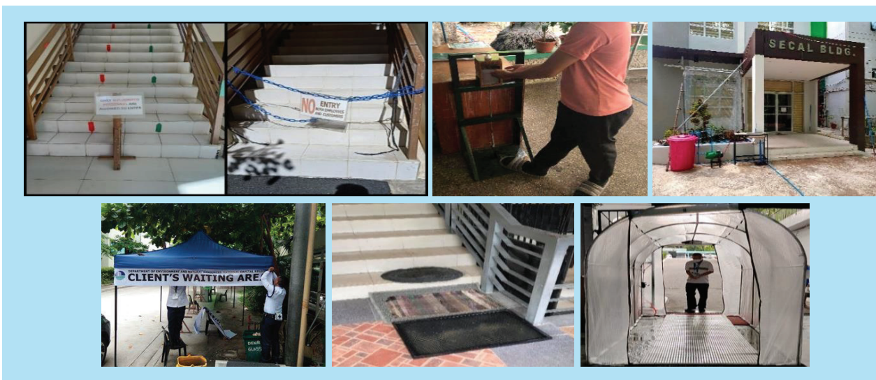
Figure 21.6 Installed health protocol signages, protective barriers, hand washing stations, and foot rug disinfectants, among others, are duly maintained in all the DENR Offices.