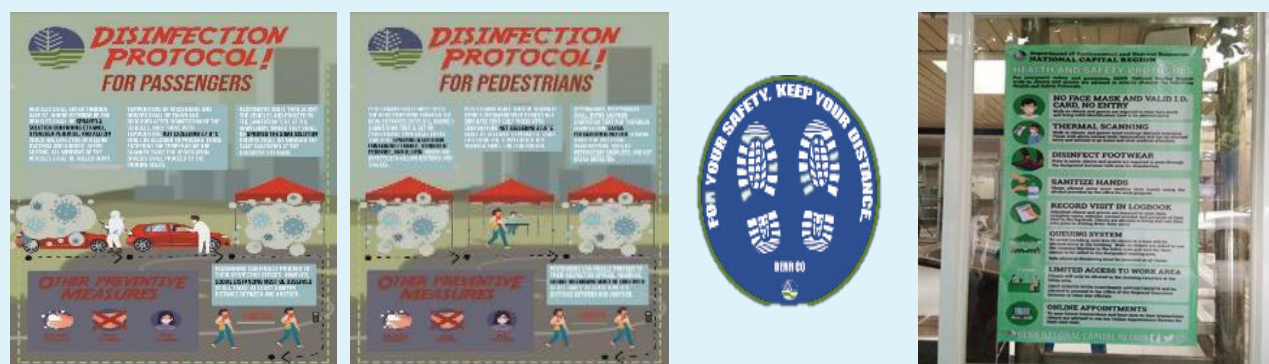
Figure 21.7 Infographics for information of employees and visitors were put in conspicuous places in DENR Offices for instant visibility. This is one of the information dissemination strategies of DENR Offices to help control the spread of COVID-19.