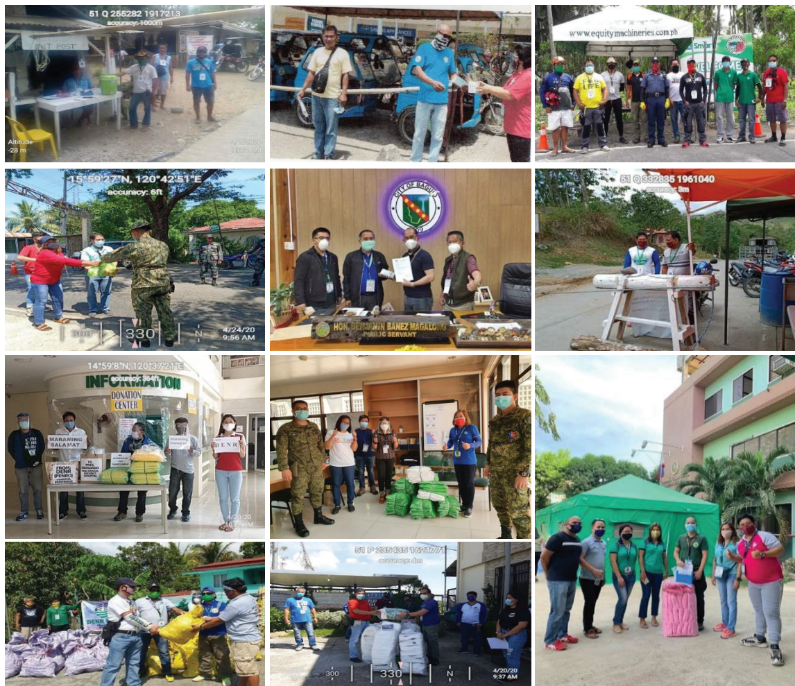
Figure 21.3 DENR employees initiated in managing COVID-19 checkpoints and in repacking of relief goods

For external beneficiaries alone, 79,934 units of PPEs, thermal scanners and even ventilator cartridges and 2,926 liters of alcohols were provided particularly to hospitals, frontliners and communities, amounting to Php 11,647,134.10.