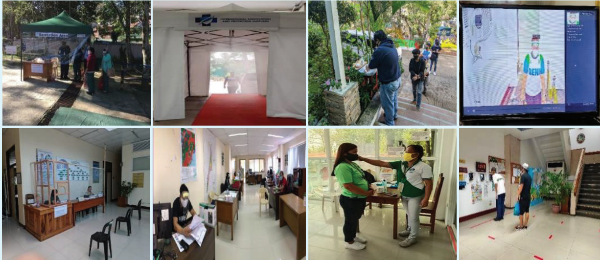
Figure 21.5 Protocol in all DENR Offices nationwide that all employees and clients entering the office and its premises are subjected to body temperature checking and hand disinfection using alcohol.

The DENR Central and Regional Offices including the Bureaus continued to undertake various measures to protect the welfare of employees and ensure their safety including their clients through the strict implementation of health protocols such as social distancing, wearing of face shields and face masks, and personal hygiene, among others.