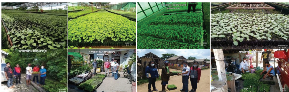
Figure 21.4 Vegetable seedlings produced from the MMFN were distributed to target beneficiaries

Through this initiative, the DENR was able to produce 3,227,924 vegetable seedlings. Of these, 1,743,620 seedlings were distributed to the Local Government Units, communities, and People’s Organizations (POs). Aside from vegetable seedlings production, a total of 13,575,803 forest tree seedlings were produced from the MMFN.