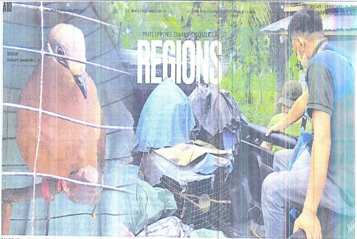
SAVED The white-eared brown doves (at left and in cages), locally known as "alimokon," seized from a safe house of a vlogger in Glan, Sarangani, on Monday are in the custody of the Department of Environment and Natural Resources (DENR) and will soon be released back to the wild.