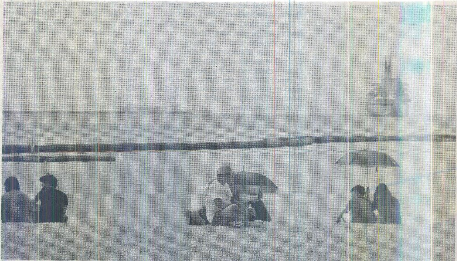
SEVERAL couples spend Valentine's Day at Dolomite Beach overlooking Manila Bay along Roxas Boulevard in Manila.