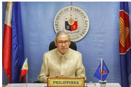
Secretary of Foreign Affairs Teodoro L. Locsin Jr.

THE Philippines will terminate its relationship with any Chinese company that was involved in the massive island-building reclamation conducted by China in the South China Sea, Foreign Affairs Secretary Teodoro L. Locsin Jr. said on Friday.