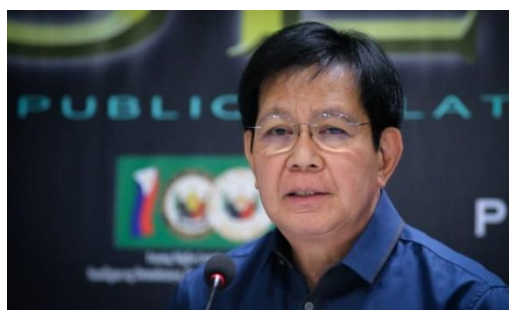
Senator Panfilo M. Lacson

Senator Panfilo “Ping” Lacson on Friday welcomed Department of Foreign Affairs (DFA) Secretary Teodoro Locsin, Jr. for saying he would “strongly” recommend the termination of contracts between the government and Chinese companies involved in reclamation activities in the West Philippine Sea.