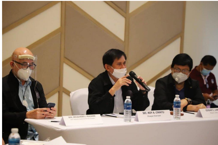
Environment Secretary Roy Cimatu, chief coronavirus disease (COVID-19) response implementor in the Viayas

BACOLOD CITY – Environment Secretary Roy Cimatu, who was tasked by President Duterte to help in bringing down the incidence of the coronavirus disease (COVID-19) in Cebu City, will be arriving here on Thursday with two other Cabinet officials to assess the city's own response to the coronavirus crisis.