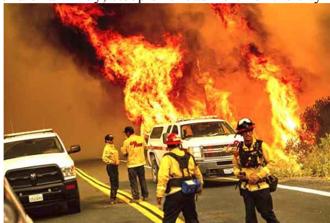
INFERNO Flames from the LNU Lightning Complex fires leap above Butts Canyon Road on Aug. 23, 2020 in Lake County, California. AP PHOTO

At the CZU Lightning Complex fire in the Santa Cruz Mountains, south of San Francisco, authorities announced the discovery of the body of a 70-year-old man in a remote area called Last Chance. The man had been reported missing and police had to use a helicopter to reach the area, which is a string of about 40 off-the-grid homes at the end of a windy, steep dirt road north of the city of Santa Cruz.