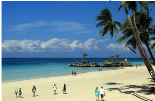
Boracay Island